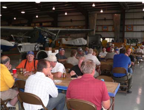
We had another well-attended meeting, with an abundance of tasty food.