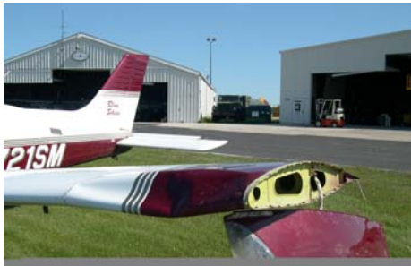
The Piper Archer, before and after.

(Finally) Finished repairs on an RV-9A that nosed over while landing at the Berlin Airport. We learned that homebuilt aircraft present extra challenges in rebuilding and