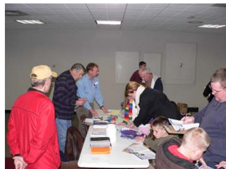
Y.E. ground crew registers kids before their flights at the April 2012 fly-in.

As always we want to make sure this is a safe, fun event for everyone involved.