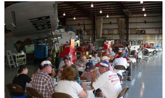
At last years' August meeting, members enjoy a potluck dinner under the wing of the Ford Tri-motor.

The evening will allow everyone to not only enjoy a nice meal with fellow members, but also allow everyone a peak inside the Weeks Hangar to see what the latest projects are, etc.