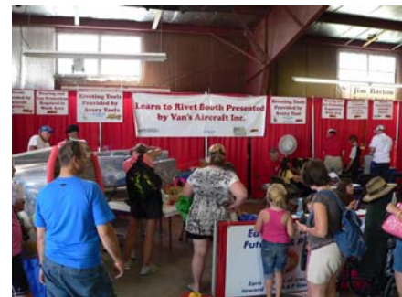
A Vans RV-12 was being built. Wood wing construction was also part of the program.