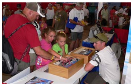
...and, some basic electrical training.

I was really impressed with the Junior A&P Area, where kids could sign up to work through a variety of technical skills stations. This area seemed to also benefit from good corporate sponsorship, and at least while I was there – the facility was very crowded with kids (and a few parents as well) who were excited about learning.