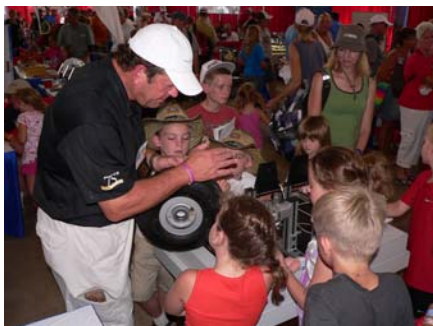
Kids learned about tires & wheels. I don't remember seeing that much interest shown in A&P school!

This year I had my first opportunity to visit KidVenture. Wow! Operating out of Pioneer Airport, the venue provides a wide variety of activities for younger members of the EAA family. There was a large variety of hands-on opportunities, including AMA with model building and U-control flying demonstrations.