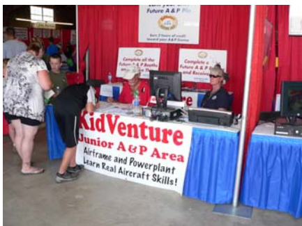
Be a Junior A&P Mechanic! – Cool!