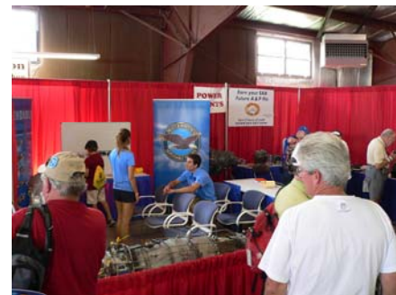
Kids learned about turbine and piston engine operation.