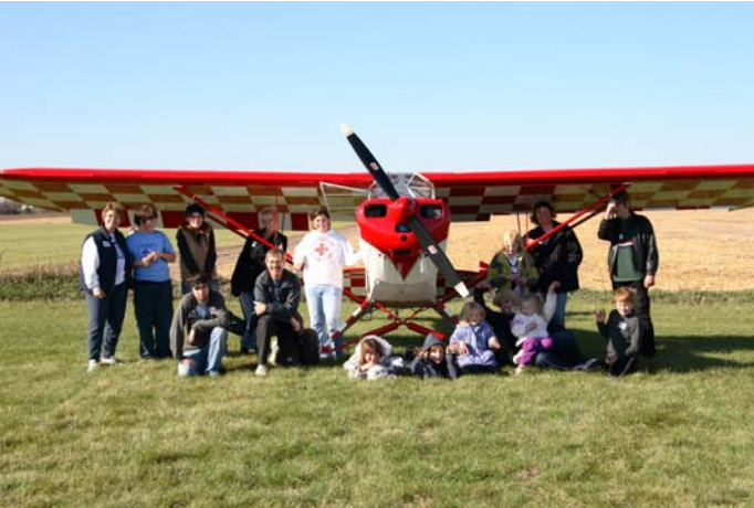
Photo: Rebel Alliance Theater troupe hung out at the Sky Ranch for a couple of hours playing games and enjoying a sunny November morning highlighted by their airplane rides.

Did you know you can put the spark of fun in a young person's eye, all with a few gallons of avgas? That's exactly what happened on November 3 rd at the Oshkosh Sky Ranch as EAA Chapter 252 members and friends shared the joy of flight at the Young Eagles Flight Rally.