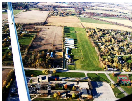
Cottonwood Airport, Rockford, IL Photo by Lou Moon, Chapter 22.

Notable displays will include one from Wisconsin's own American Champion. EAA252